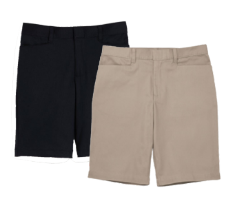
Navy or Khaki Shorts Donald's Uniform or your preferred vendor (no cargo or denim shorts)