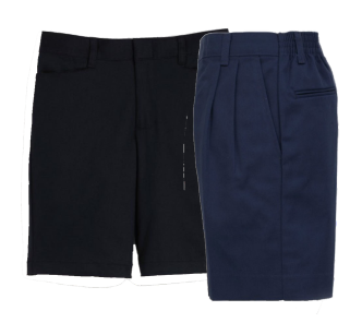
Navy Shorts Donald's Uniform or your preferred vendor (no cargo shorts)