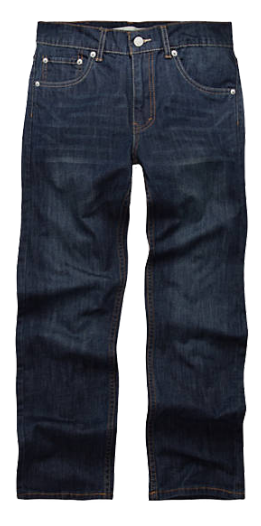
Jeans No jeggings, leggings or cargo pants. No unhemmed or frayed pant bottoms. No rips, tears or holes. No denim shorts.