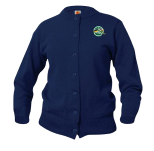
Girls Crewneck Cardigan Navy with New Life Academy logo Donald's Uniform