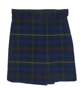
Girls Plaid Skirt Navy or black leggings or shorts MUST be worn under skirts.