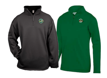
Gray/Green pullover Campus Spirit Store