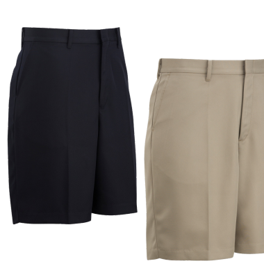
Navy or Khaki Shorts Donald's Uniform or your preferred vendor (no cargo or denim shorts)