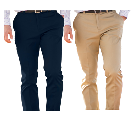
Navy or Khaki Pants Donald's Uniform or your preferred vendor (no jeggings, denim, or cargo pants)