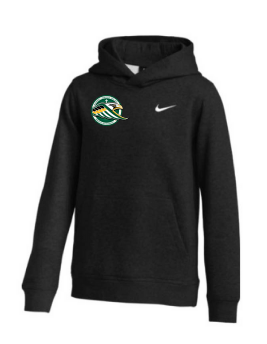
Black Hoodie with Logo Campus Spirit Store