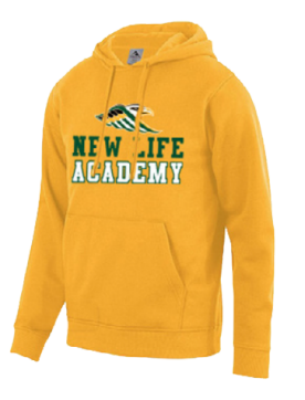
Any NLA sweatshirt