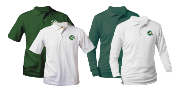
Unisex Interlock Knit Polo Shirt Green or White with New Life Academy logo Donald's Uniform - Long sleeve or short sleeve

All clothing items must be NLA approved and official uniform. All tops must contain only the NLA or athletic logo on the chest. All other designs are spirit wear on Fridays only. Uniform code requires all layers to be NLA shirts or jackets.