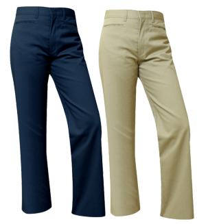
Navy or Khaki Pants Donald's Uniform or your preferred vendor (no jeggings, denim, or cargo pants)