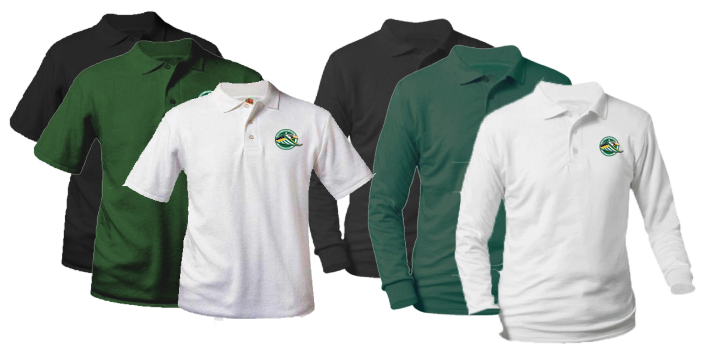
NLA Polo Shirt Black, Green or White with New Life Academy logo Donald's Uniform - Long sleeve or short sleeve

All clothing items must be NLA approved and official uniform. All tops must be green, black, white, or grey and contain the eagle logo or New Life text on the front. All other colors and designs are Friday Spirit Wear only. Uniform code requires all layers be NLA shirts or jackets. No non-NLA jackets or outerwear may be worn in the classroom during the school day. If students would like to layer, they must have a NLA sweatshirt or NLA jacket.