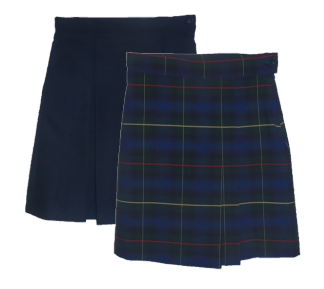
Navy or Plaid Box Pleat Skirt Donald's Uniform. Navy or black knit tights or leggings MUST be worn under skirts