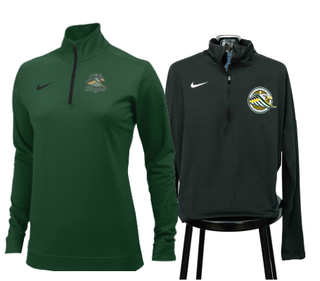
NLA Nike Dri-Fit 1/2 Zip