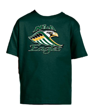
Full chest logo short-sleeve or long-sleeve Campus Spirit Store