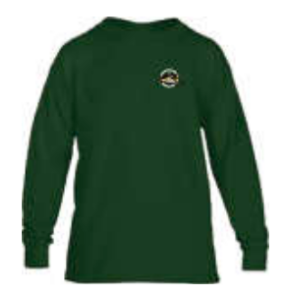
Green Long sleeve with Simple logo Campus Spirit Store