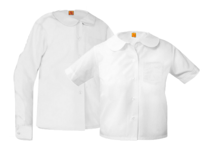
Girls Peter Pan Collar Blouse White to be worn under Jumper Long sleeve or short sleeve Donald's Uniform