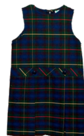
Girls Drop Waist Jumper with Box Peats Donald's Uniform