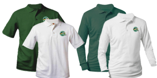
Unisex Interlock Knit Polo Shirt Green or White with New Life Academy logo Donald's Uniform - Long sleeve or short sleeve

All clothing items must be NLA approved and official uniform. All tops must contain only the NLA or athletic logo on the chest. All other designs are spirit wear on Fridays only. Uniform code requires all layers to be NLA shirts or jackets.