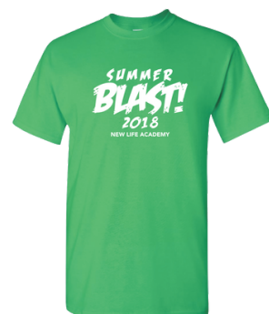
Any NLA t-shirt