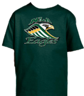
Full chest logo short-sleeve or long-sleeve Campus Spirit Store