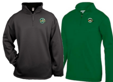
Gray/Green pullover Campus Spirit Store