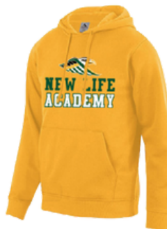
Any NLA sweatshirt