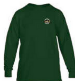
Green Long sleeve with Simple logo Campus Spirit Store