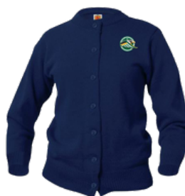
Girls Crewneck Cardigan Navy with New Life Academy logo Donald's Uniform