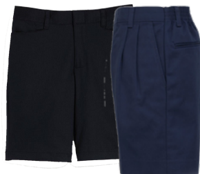
Navy Shorts Donald's Uniform or your preferred vendor (no cargo shorts)