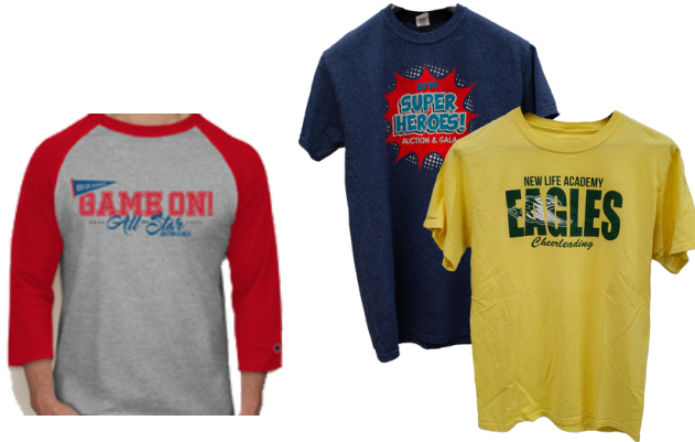
Any color NLA long-sleeve

No jeggings, leggings or cargo pants. No unhemmed or frayed pant bottoms. No rips, tears or holes. Denim shorts are not allowed.