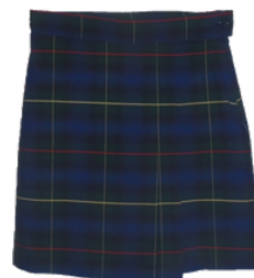
Girls Plaid Skort Pleats Skort with 2 pleats and built in knit short. Donald's Uniform