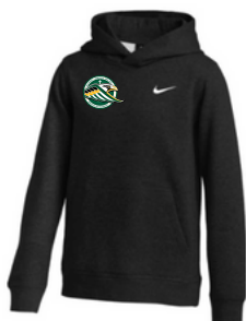
Black Hoodie with Logo Campus Spirit Store