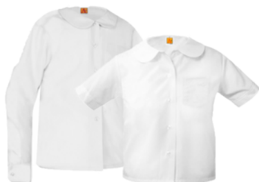
Girls Peter Pan Collar Blouse White to be worn under Jumper Long sleeve or short sleeve Donald's Uniform