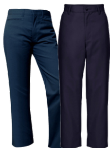
Navy Pants Donald's Uniform or your preferred vendor (no jeggings or cargo pants)