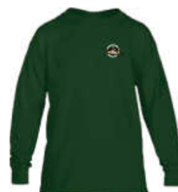
Green Long sleeve with Simple logo Campus Spirit Store