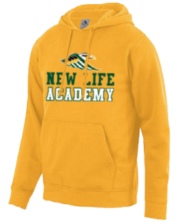
Any color NLA Sweatshirt