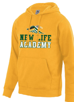
Any NLA sweatshirt