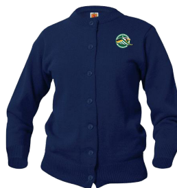
Girls Crewneck Cardigan Navy with New Life Academy logo Donald's Uniform