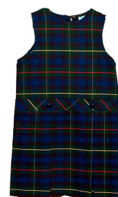
Girls Drop Waist Jumper with Box Peats Donald's Uniform