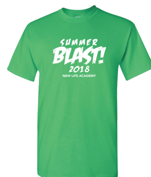
Any NLA t-shirt