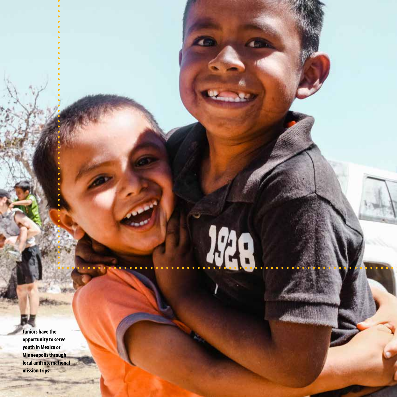
Juniors have the opportunity to serve youth in Mexico or Minneapolis through local and international mission trips