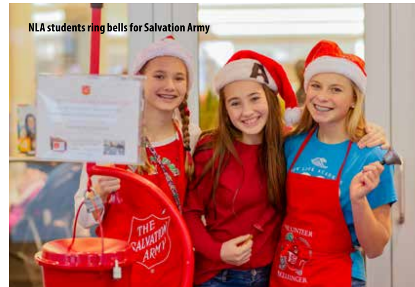
NLA students ring bells for Salvation Army