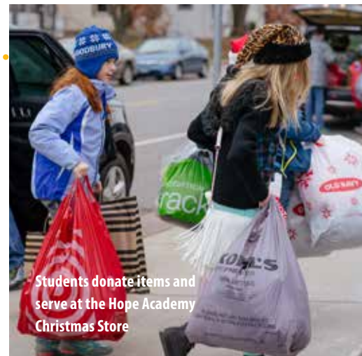
Students donate items and serve at the Hope Academy Christmas Store