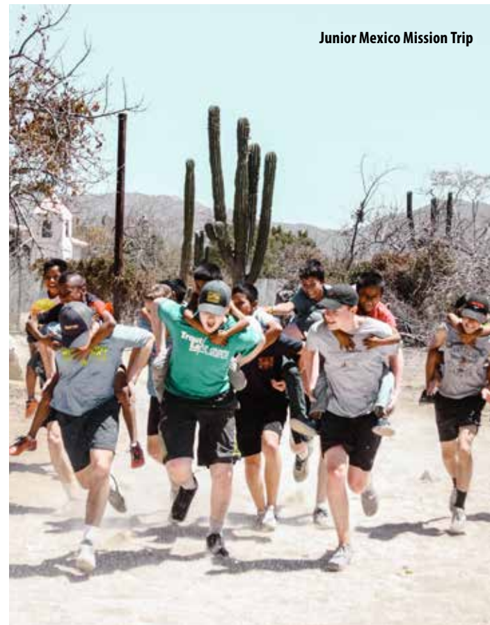
Junior Mexico Mission Trip